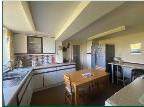
1ST FLOOR 503 sq.ft. (46.8 sq.m.) approx.